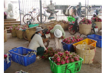
GAP ensures consumers have safe healthy high quality food.

Many high value horticulture crops such as fruits, vegetables and nuts are often eaten raw. As such, good production and handling practices are important to reduce micro-organisms (like bacteria) to ensure the safety and health of consumers.